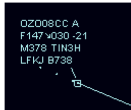
Example of target with labels attached

Each aircraft is one unique target on screen.